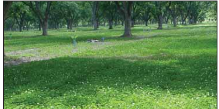
Pecan producers are adding Durana to the orchard floor forage mix to reduce N costs and attract beneficial insects.

Responding to the commercial landscape industry's desire for a more sustainable and aesthetically pleasing slope vegetation mix, Pennington recently released the SlopeMaster product line which features Durana as a key ingredient. Durana provides up to 150 lbs. of free nitrogen and shares it with companion plants to reduce fertilizer costs. It also provides color which makes for more aesthetically pleasing areas. With its aggressive stolon production (97 stolons per sq. ft.), Durana is a natural fit as an erosion control plant.