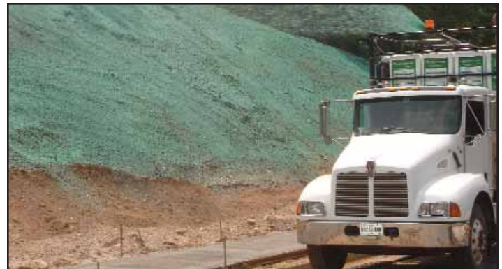
Responding to the commercial landscape industry's desire for a more sustainable and aesthetically pleasing slope vegetation mix, Pennington recently released the SlopeMaster product line with Durana as a key ingredient.